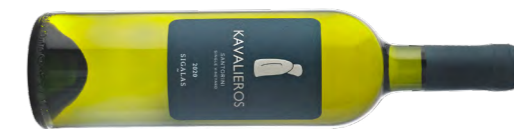
Kavalieros Single Vineyard