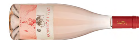
Serra Ferdinandea Rosé